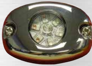
Optional Chrome Bezel: 6PKBZCHM

Easy installation. No install screws needed, just pop it in a 1 inch mounting hole.