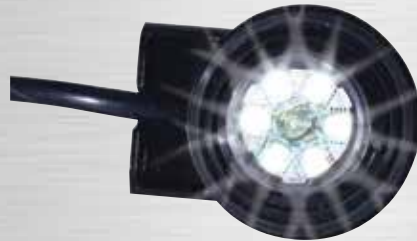
Twist Lock 6 Pack LED Hide-A-Blast for Ford Police Interceptor Sedan Head Light, PI Utility (2016+) Tail Light and PI Utility (2012-2014) Headlight