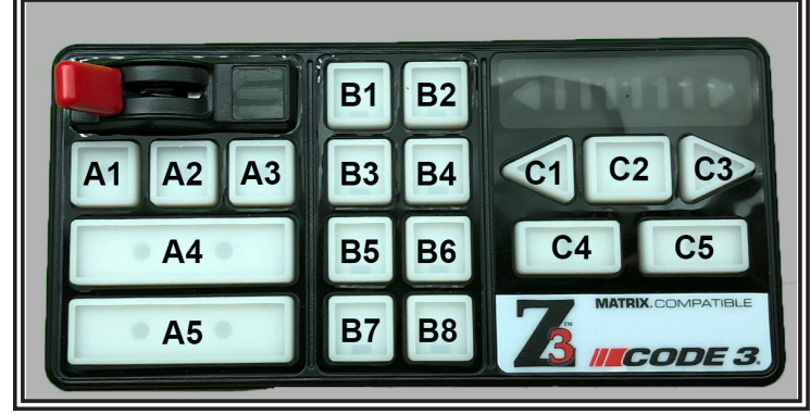
Figure 4 - Rotary Control Head Key